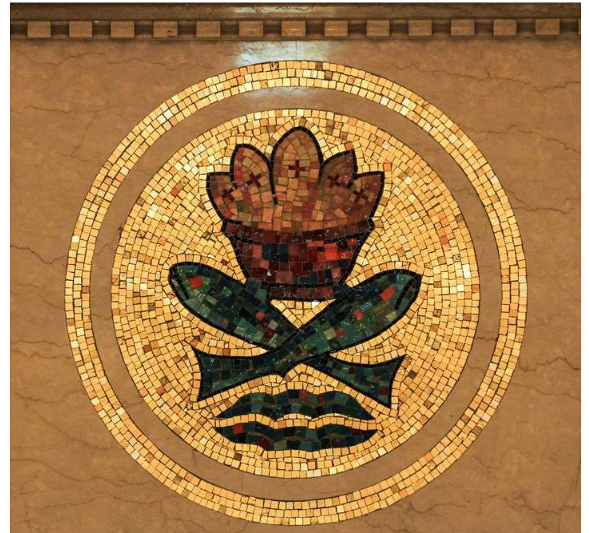
This mosaic roundel is on the High Altar of the Basilica of the National Shrine of the Immaculate Conception in Washington DC.

Please submit prayer needs, praises, & updates by note or email to the office: faithumc@hotmail.com